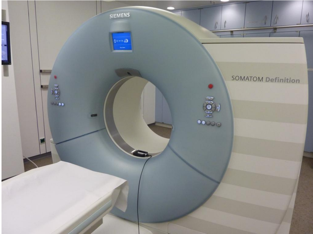
Picture 1: Overview of Siemens SOMATOM Definition CT Scanner with Unfors Xi R/F detector positioned on the gantry bottom

This application note explains how CT kV measurement shall be performed with an Unfors Xi R/F Detector and what correction factors shall be applied to gain the most accurate high voltage measurement result on Siemens SOMATOM CT Scanners.