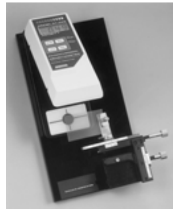
See Radiochromic Densitometer data sheet (Model 37-443) for complete specifications

Model 37-045* GAFCHROMIC XR - Type T Low Dose Rate Brachytherapy Dosimetry Media, package of five 5 x 5 inch sheets